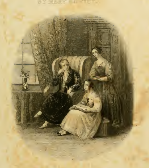
NEW YOUK D. APPLETON 200. 200 BROADWAY.